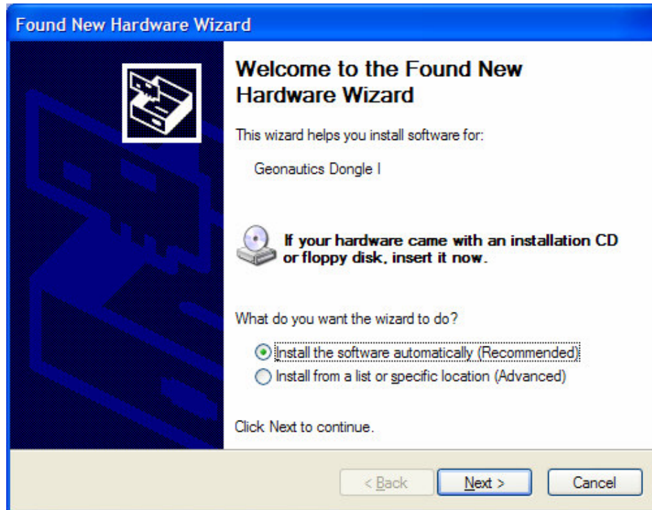
Figure 1.1. Wizard Opening Screen