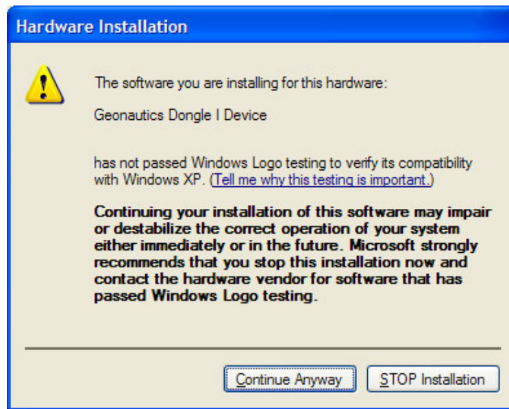
Figure 1.2. Wizard Logo Testing Warning Window